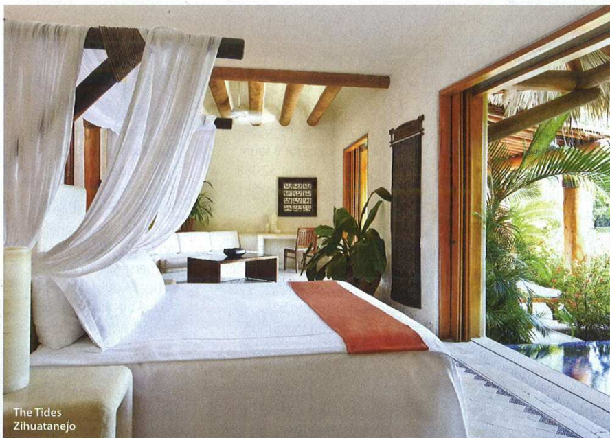
The Tides Zihuatanejo