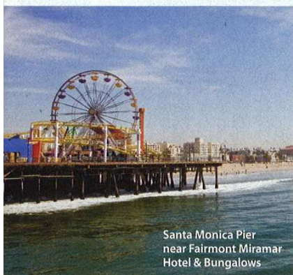
Santa Monica Pier near Fairmont Miramar Hotel & Bungalows